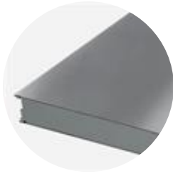
Profile option Flat