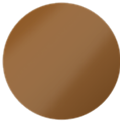
Primo Copper Metallic