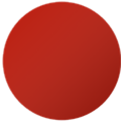
Primo Traffic Red 3020