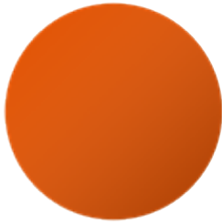
Primo Pure Orange 2004