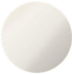
Primo Metallic White