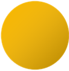
Primo Signal Yellow 1003