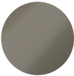
Primo Bronze Metallic