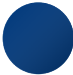
Primo Ultramarine Blue 5002