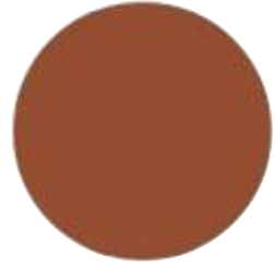
RR750 Tile Red