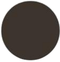
RR32 Dark Brown